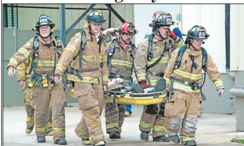
Firefighters carrying one of their own during the drill.