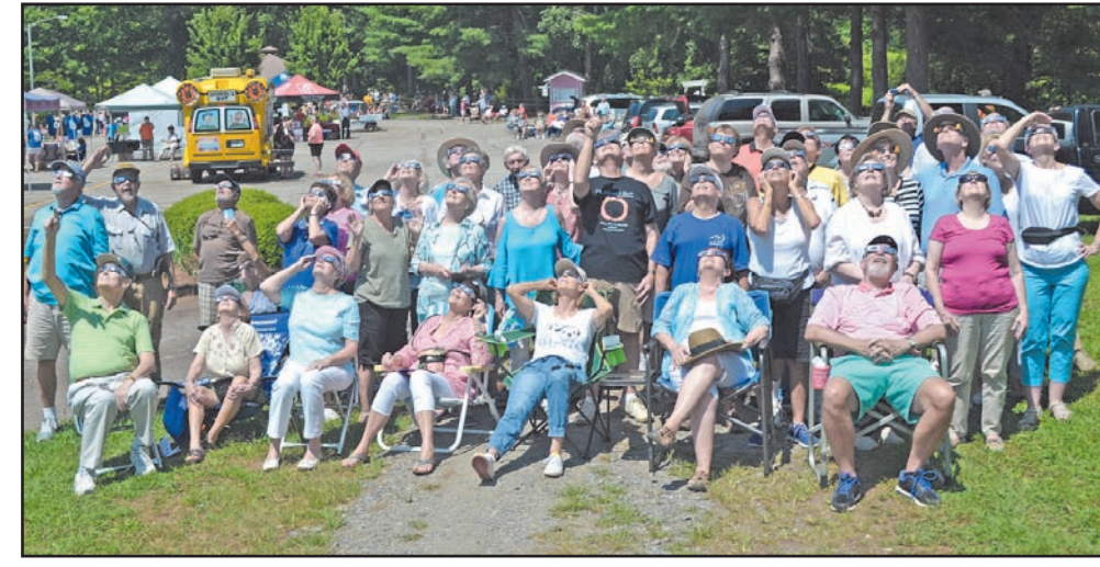
A crowd looks on as the moon begins to cover the sun's pathway in Towns County on Monday, {f Aug.21}, as the darkness of the Great American Eclipse unfolded over the Top of Georgia. More than 700 attended the first, and possibly only, Georgia Mountain Fairgrounds Great American Eclipse Tailgate Party.